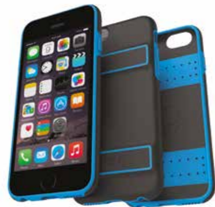
iPhone® 6 Plus

THE PELI PROGEAR™ GUARDIAN PHONE CASE HAS BEEN DESIGNED IN BARCELONA AND ENGINEERED IN THE U.S.