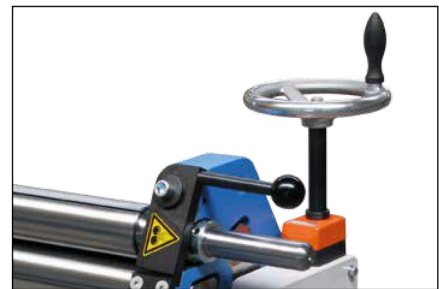
Positioning of the back roll