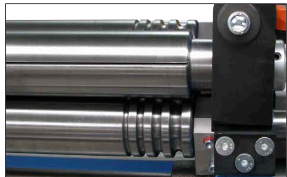
Folding groove and wiring channels