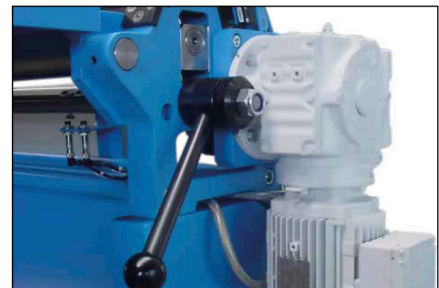
Motorized infeed of the back roll