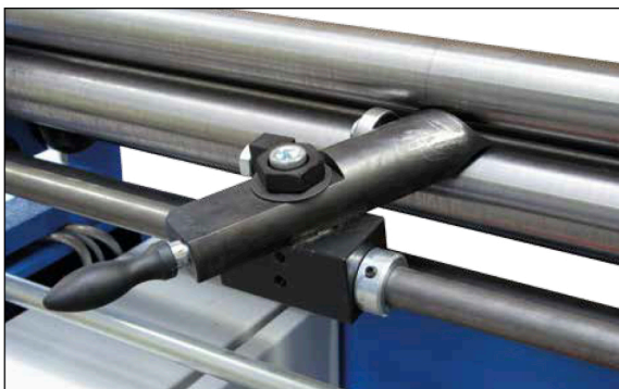
Side stop for conical rounding